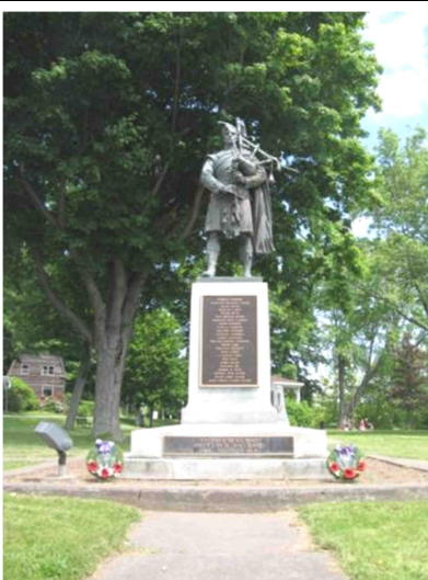
The World War I Cenotaph in New Glasgow, NS

I registered for my third Maritime half marathon this past spring, in Fredericton. While Nova Scotia in general and Pictou County and Cape Breton Island in particular are known as hotbeds of Scottish-Canadian culture, the same cannot be said for New Brunswick so I had given up on my "pipe dream" of running to bagpipe accompaniment. It is known more for the