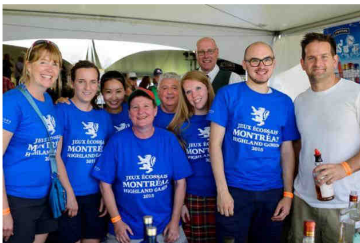
Thanks to the many volunteers who come out and help build, serve and tear down throughout the 4 days of on site management.

For those seeking the perfect gift for someone (or themselves!) our silent auction promises to be the best ever. With approximately $25,000 worth of goods and services up for grabs there is something for everyone. This year we will be starting our auction 'online' in advance of the Ball to allow for greater reach to our St. Andrew's community. The auction will hit full stride at the ball itself and be concluded by 'in-person' bidding.