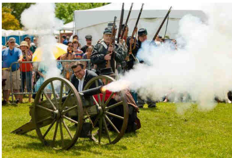
Mayor Denis Coderre fires the cannon signalling the launch of the games.