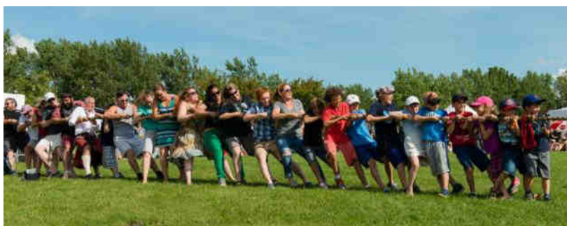
The community takes on the Black Watch for the final tug of war challenge; rumour has it the community won!

Finally, our team that coordinated the Tug of War was once again truly appreciated, funds raised from this event was presented to the Children's Wish Foundation and this year I requested representatives