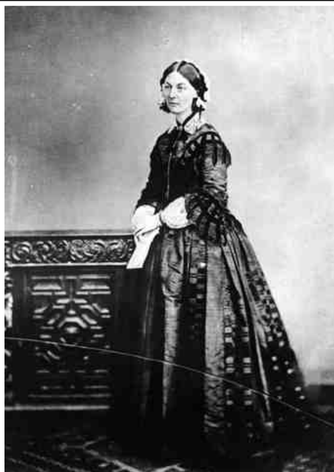
(Florence Nightingale circa 1856)

This visit convinced her that nursing would be her vocation in life, and this was where she wanted to study. Her parents finally accepted the fact that their daughter was determined to receive nurses training. In 1851, they arranged for her to travel to Kaiserswerth accompanied by the family housekeeper as her chaperone, thereby conforming to the Victorian etiquette of the times. A respectable young woman, because of her social status, was not allowed to travel