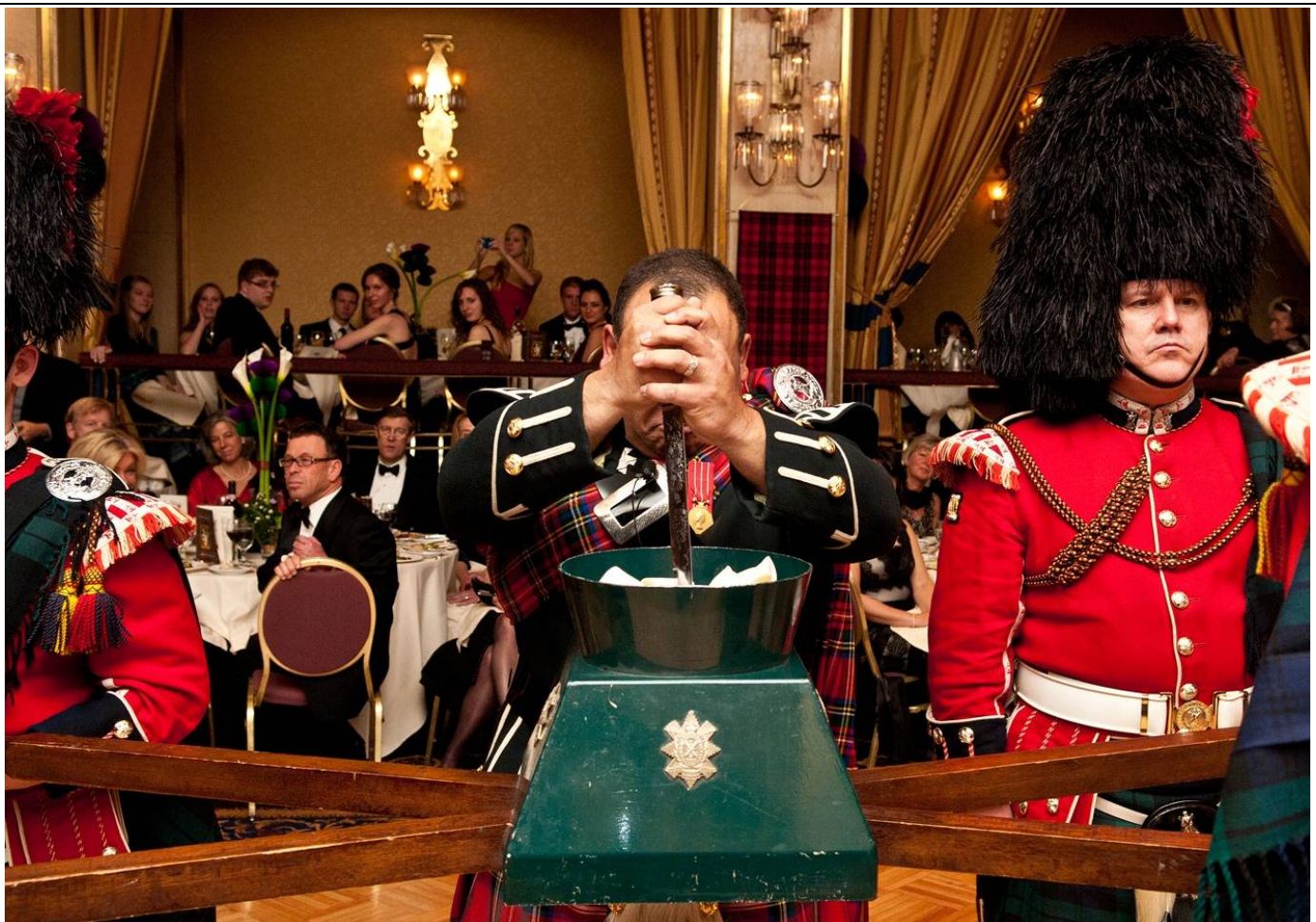
One of the fantastic moments at the Montreal's St. Andrew's Ball 2011.