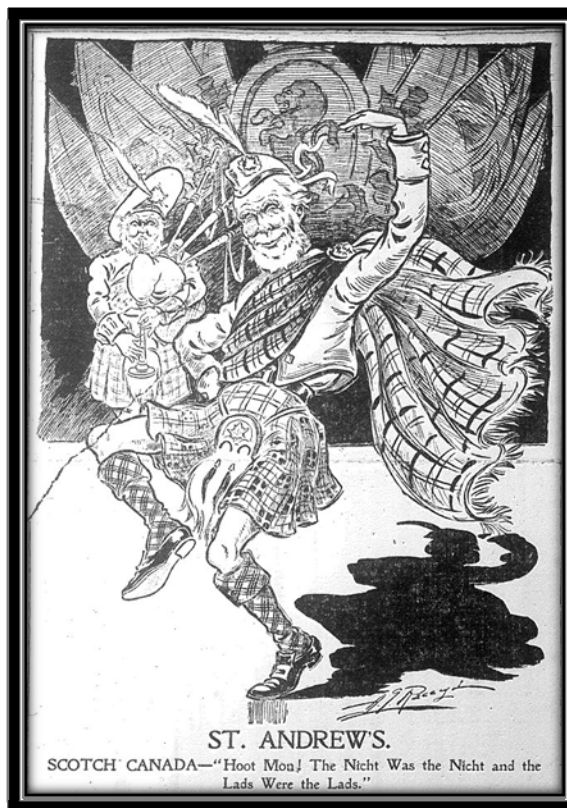
Montreal Daily Star, St Andrew's Day 1900

His work as Exciseman entailed much travel and some danger. He was involved in an armed attack on a smuggling ship and had to wade chest-deep into the Solway. This brought on a bout of his illness. The cure was to immerse himself in the chilly waters