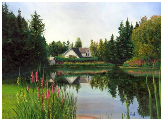
Figure 3: Reford Gardens at Metis by Marc Andre Ruel. 6

The donation of these lovely sporrans to the Society's collection highlights the important role