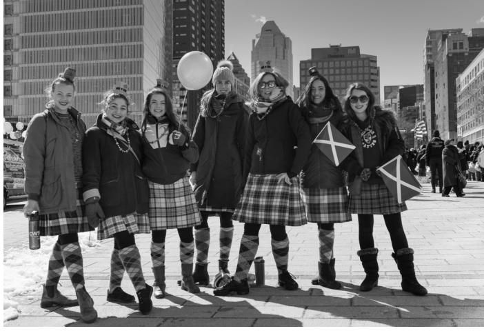
Wearing plaid at the St. Patrick's Day Parade

On a very blustery and cold night for April 4, many members attended our Tartan Day Trivia Night and got busy answering Scottish-themed questions, rang-