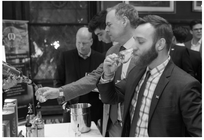
Sampling the fine whiskies at WhiskyFête.

WhiskyFête 2018 took place on February 22 at the prestigious Mount Royal Club. Almost 200 guests enjoyed the opportunity to sample a collection of rare and exclusive whiskies assembled for the occasion by the experts at Ouidram. The evening was a great success, raising $40,000 to benefit the Montreal Neurological Institute. Plans are already underway for next year's event to be held on February 21, 2019, so mark your calendars!