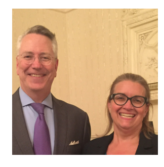
2018 ANNUAL GENERAL MEETING Page 3