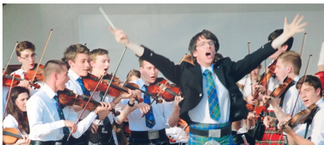
SCOTS IN THE PARK: THE AYRSHIRE FIDDLE ORCHESTRA Page 8