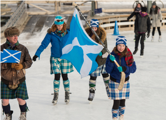
Flying the Scottish flag at the 2017 Kilt Skate

We kicked off the year with our Sir John A. Macdonald Kilt Skate at the Old Port on a chilly January 14.