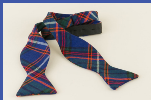
BOW TIE $35.00