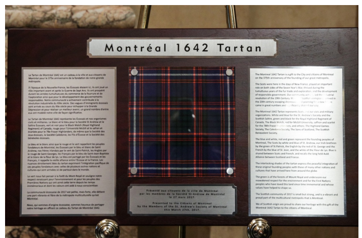
Official Montreal 1642 tartan plaque displayed in Montreal City Hall