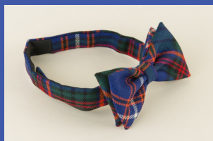
BOW TIE (PRE-TIED) $35.00