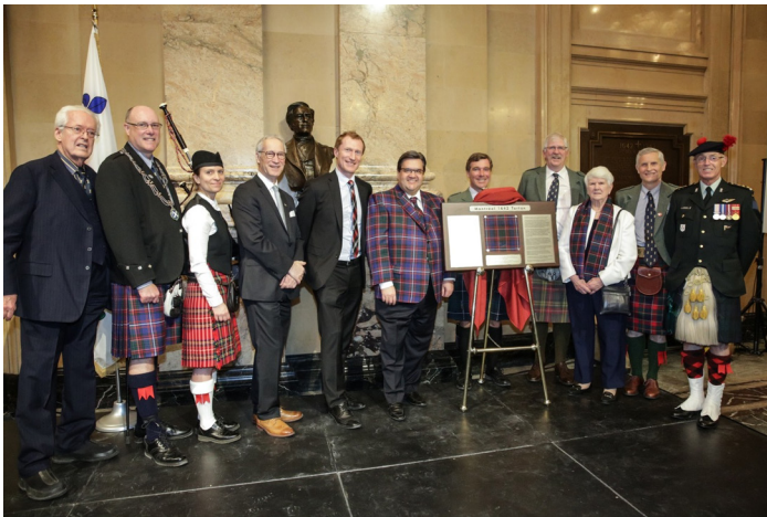
SAS Council and Past Presidents, and Montreal City Council Members

On March 27, the St. Andrew's Society of Montreal unveiled the Montreal 1642 tartan at Montreal City Hall with Mayor Denis Coderre.