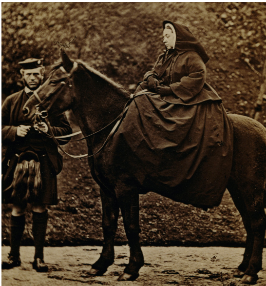
An 1863 G.W. Wilson photograph of Queen Victoria and John Brown on the grounds of Balmoral Castle, a scene replicated in the movie Mrs. Brown.