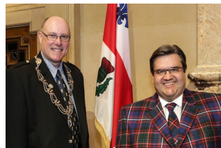
MONTREAL 1642 TARTAN PRESENTATION Page 13