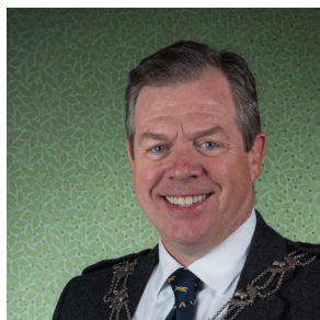
PRESIDENT'S MESSAGE: Page 2