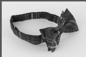
BOW TIE (PRE-TIED) $35.00