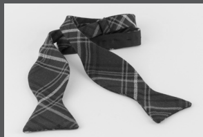
BOW TIE $35.00