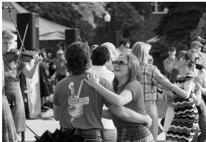
People of all ages dancing at Scots in the Park

event in Strathearn Park. The crowd appreciated the stirring music and youthful energy of the performers, and it was a pleasure to see the best of Scottish culture being shared with the community at large. We wish these talented young performers all the best!