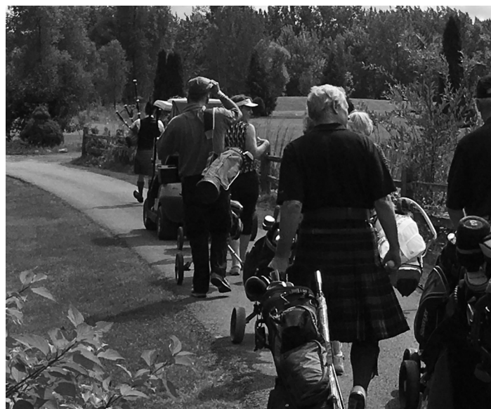
Piping the golfers onto the green at Tee-Off in Tartan

A "Pop-up-Piper" led the foursomes across the glen to our Tee-Off in Tartan golf tournament on August 26 at the Caughnawaga Golf Club. It is a sight that we plan to repeat for the 5th Annual Tournament, and we hope that many will save the date of Saturday, August 25, 2018.