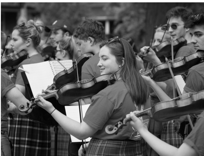
Members of the Ayreshire Fiddle Orchestra

On July 9, the St. Andrew's Society was thrilled to welcome Scotland's Ayreshire Fiddle Orchestra at our Scots in the Park