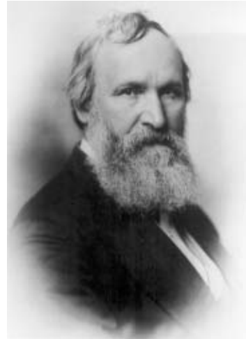
Hon. John Young, 1864-66