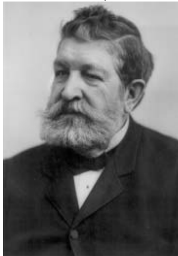
Sen. A. W. Ogilvie, 1870-71