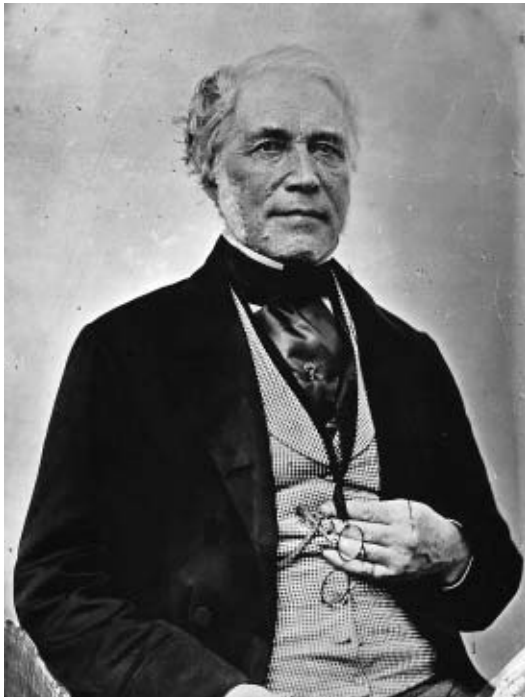
Hon. Peter McGill, copied 1866, I-21029.0 (Detail), McCord Museum of Canadian History, Montreal

Peter McGill (McCutcheon) was born in August, 1789 at Cree Bridge, Wigtownshire, Scotland, son of John McCutcheon and Mary McGill, sister of the Hon. John McGill, Receiver-General of Upper Canada. At the suggestion of his maternal uncle, he came to Canada in 1809 and engaged in business in Montreal, later founding the mercantile firm - Peter McGill & Co. The Hon. John McGill, being childless, made his nephew his heir, bequeathing to him his extensive and valuable estates, on condition that he assumed the surname of McGill.